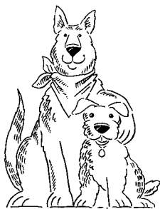
Be a Mentor

We had great response to the mentor program last year but not enough people willing to be mentors. Please consider participating in this program which is all about making our new families feel welcome and to better understand the LAGC organization. We would like a list of mentors to match to new families prior to DaCapo. If you are willing to help out please contact jodid@flintcom.com or call 701-306-2270. Keep in mind that you don't have to know everything about LAGC and we will supply you with a calendar of communication to share with your mentor family.